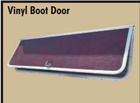
Vinyl Boot Door

The boot door incorporates a secure lock laminated infill panel with option of vinyl, aluminium or checkerplate infill panel with telescopic stays or optional gas struts.