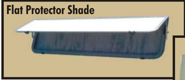
Flat Protector Shade