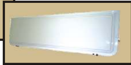
Remington Protector Shade